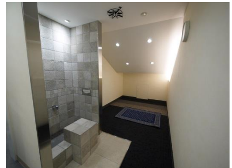
Prayer room interior

In addition to this, the Osaka Station City has had the following initiatives for international passengers visiting Japan.