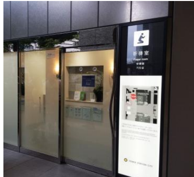
Prayer room exterior